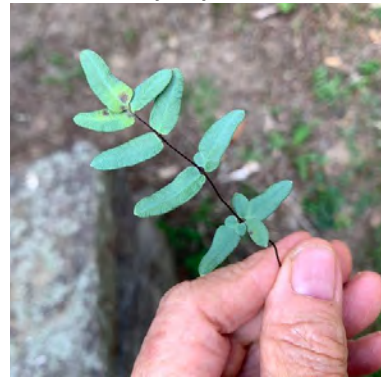
Pellaea glabella Smooth Cliffbrake

In Mt. Airy, we saw a colony of smooth cliffbrake ( Pellaea glabella ) that has been thriving on the station's stone bridges since at least the 1930s, when it was noted by Edgar Wherry. Named for its smooth stem, it is less common than purple cliffbrake ( Pellaea atropurpurea ), which is distinguished by its hairy stem. We were able to compare these stems in Chestnut Hill,