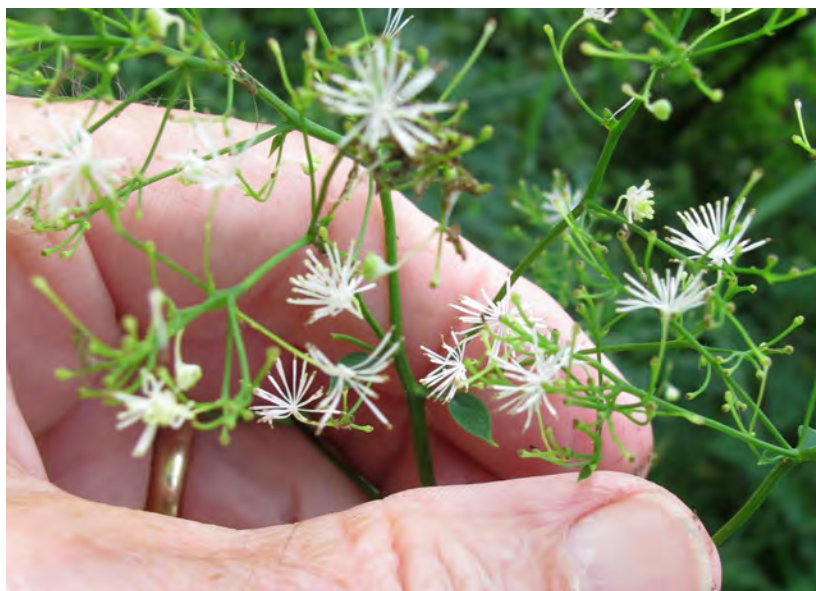
RANUNCULACEAE Thalictrum pubescens Tall meadow Rue Upper Schuylkill River Park Trail 7/17/2022