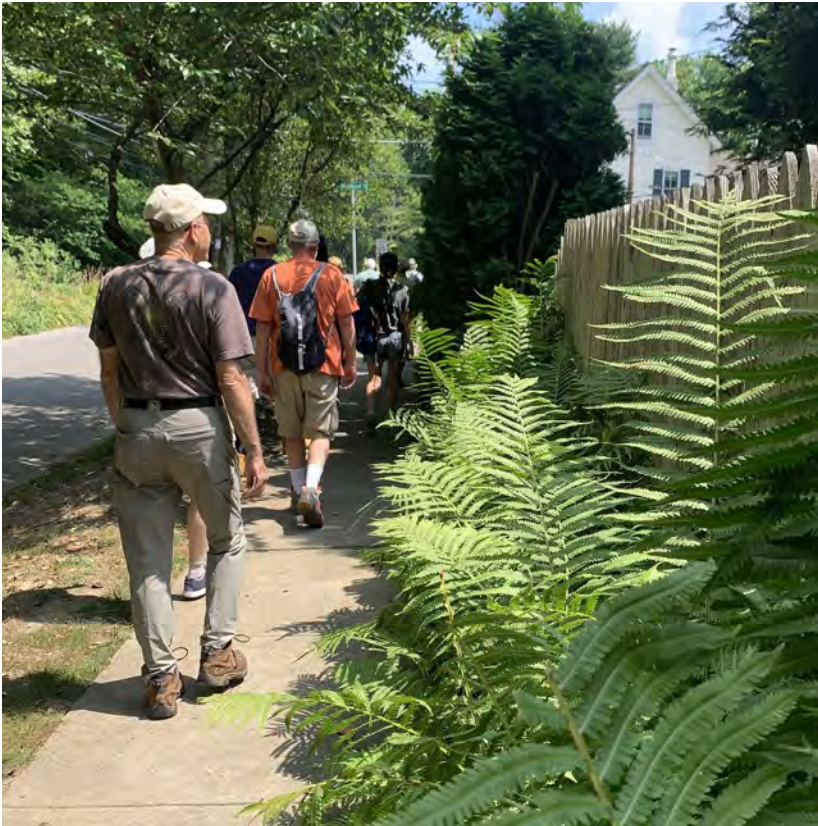
Fern Walk - Willow Grove Avenue - Chestnut Hill - Philadelphia