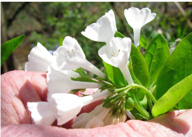
BORAGINACEAE Mertensia virginica forma alba

A few yards into our walk we saw flowering Early Saxifrage ( Micranthes virginiensis ) clinging to a rock outcropping along with some vegetative Columbine ( Aquilegia canadensis ). Below the rocks we saw flowering Bloodroot ( Sanguinaria canadensis ) and Wild Ginger ( Asarum canadense ). As we rounded the corner to the main path up Grubb Run our eyes were greeted to a blue sea of flowering Virginia Bluebells ( Mertensia virginica ). Further up the slope we spotted a white flowered Virginia Bluebell, a very rare occurrence for our enjoyment.