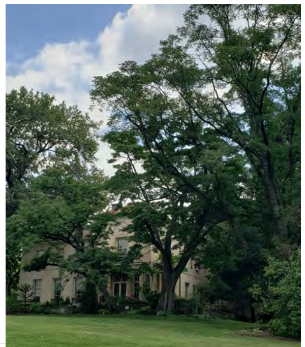
LEP NYMPHALIDAE Danaus plexippus Monarch - Delhaas Woods, Bucks Co. PA Photo above - Barnes Fern Dell Photo to right - Barnes Residence 50 Lapsley Lane, Merion Station, PA