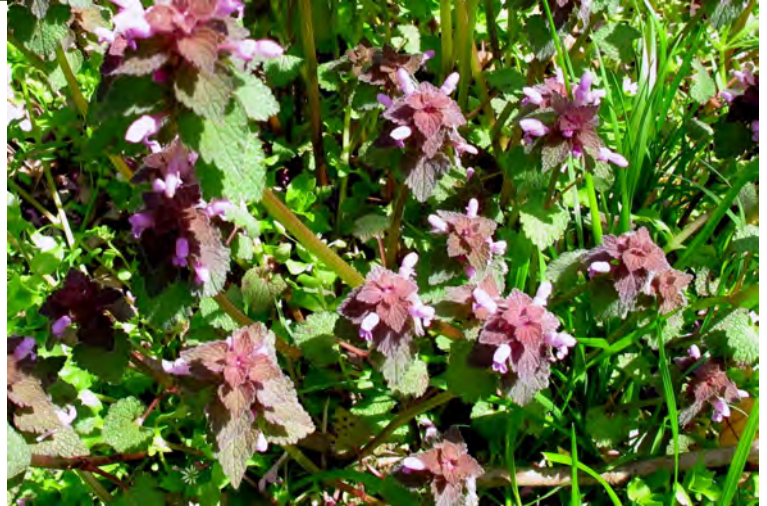
LAMIACEAE Lamium purpureum (Purple Dead-Nettle)

Dispersed throughout the valley was flowering Cutleaf Toothwort ( Cardamine concatenata ), Dutchman's Breeches ( Dicentra cucullaria ), Spring Beauties ( Claytonia virginica ), and Woodland Phlox ( Phlox divaricata ). Trillium grandiflorum was starting to show color along with Yellow Trout Lily ( Erythronium americanum ).